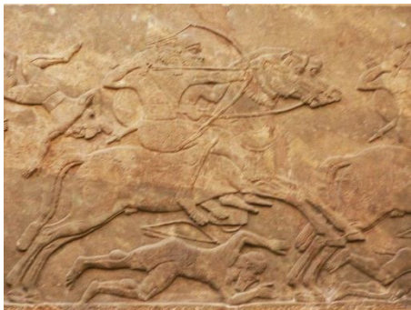
Assyrian “cavalry,” no stirrups, no true saddle

1 Kings 20:20 may be the first clear reference to flight on horseback, but verse 21 makes it clear that this battle was a chariot battle rather than a cavalry battle. It seems that the four horsemen in Zechariah 1 are mounted riders, but they are scouts more than attackers. In most biblical texts the ratio of paroshim to chariots is appropriate for the paroshim to be the chariot crews. So in the absence of any evidence for cavalry action and in the presence of clear evidence for the dominant role of chariots, EHV usually translates parosh as charioteer in early texts. This case illustrates the need for translators to look beyond the dictionary meaning listed for a word to the context, both in the text and outside of the text.