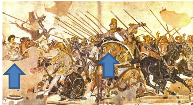
Alexander on horseback Darius in his chariot